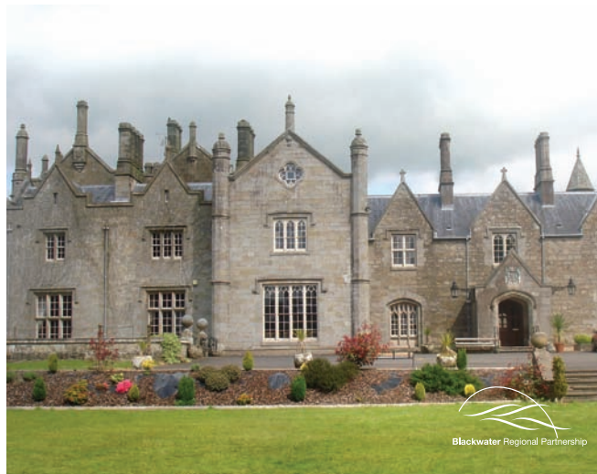
The Blackwater Region walking cards. Card 2/24